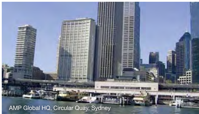
AMP Global HQ, Circular Quay, Sydney